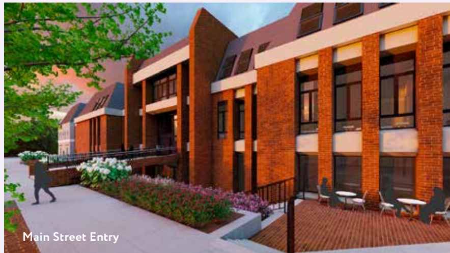
Main Street Entry

Painesville is undergoing a major revitalization of its downtown square, beginning with the transformation of the former Chase Bank Building into Lake Erie College dormitories and a significant streetscaping initiative. The city's goal is to attract additional commercial and residential development to the area. The Victoria Place project will contribute to this effort by adding 51,000 square feet of commercial space and 78 residential units. It is also expected to generate 100 construction jobs with an estimated annual payroll of $6,760,000.