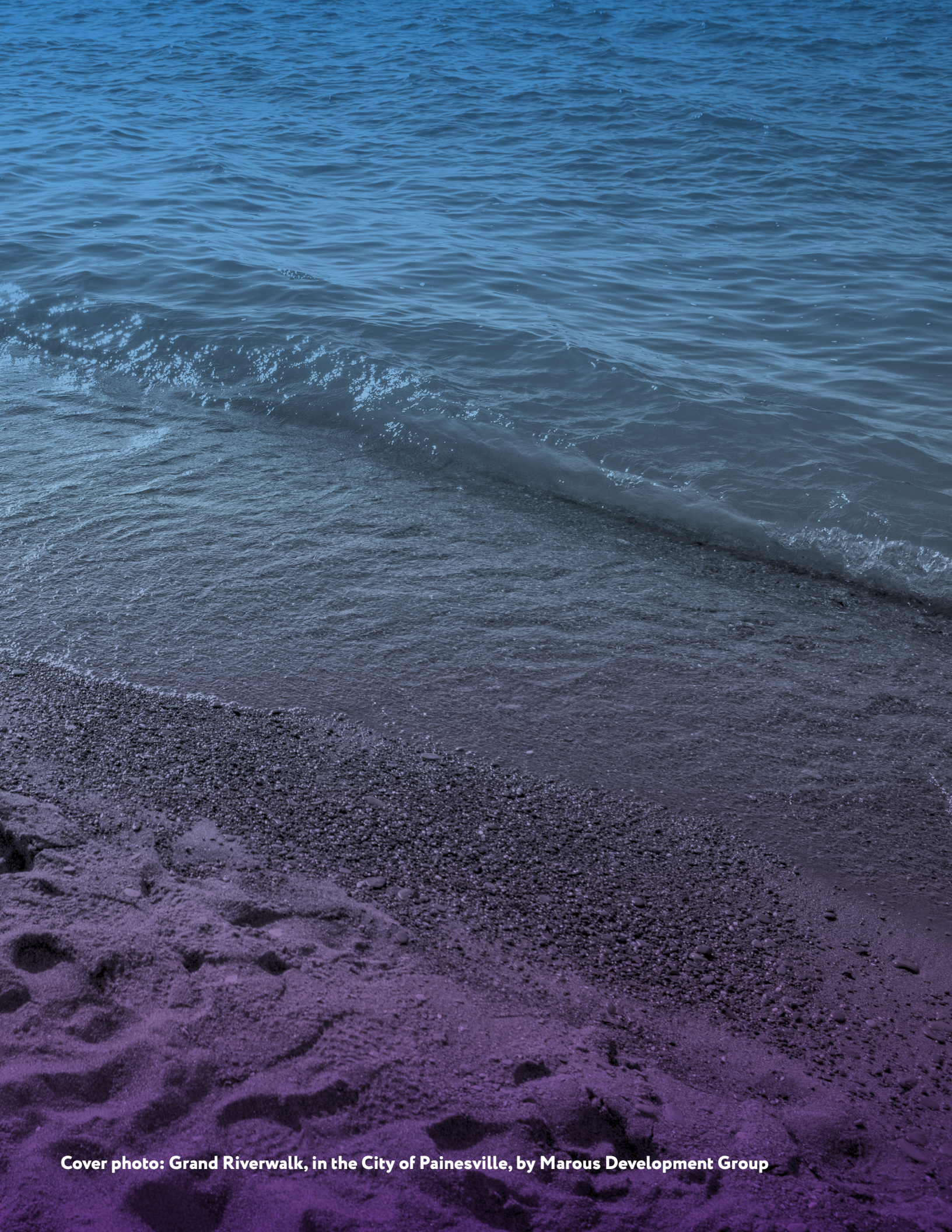
Cover photo: Grand Riverwalk, in the City of Painesville, by Marous Development Group