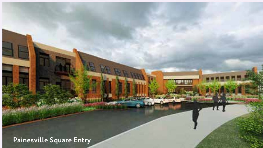
Painesville Square Entry