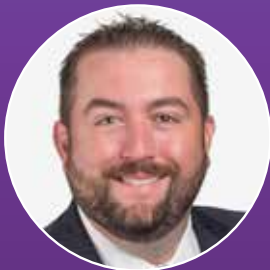
MORRIS W. BEVERAGE III, COMMISSIONER