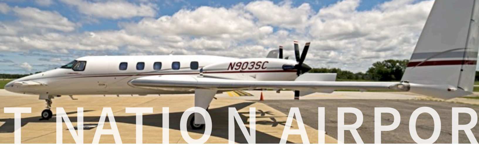
Beechcraft Starship 2000A push propeller aircraft on the ramp at Lost Nation Airport.