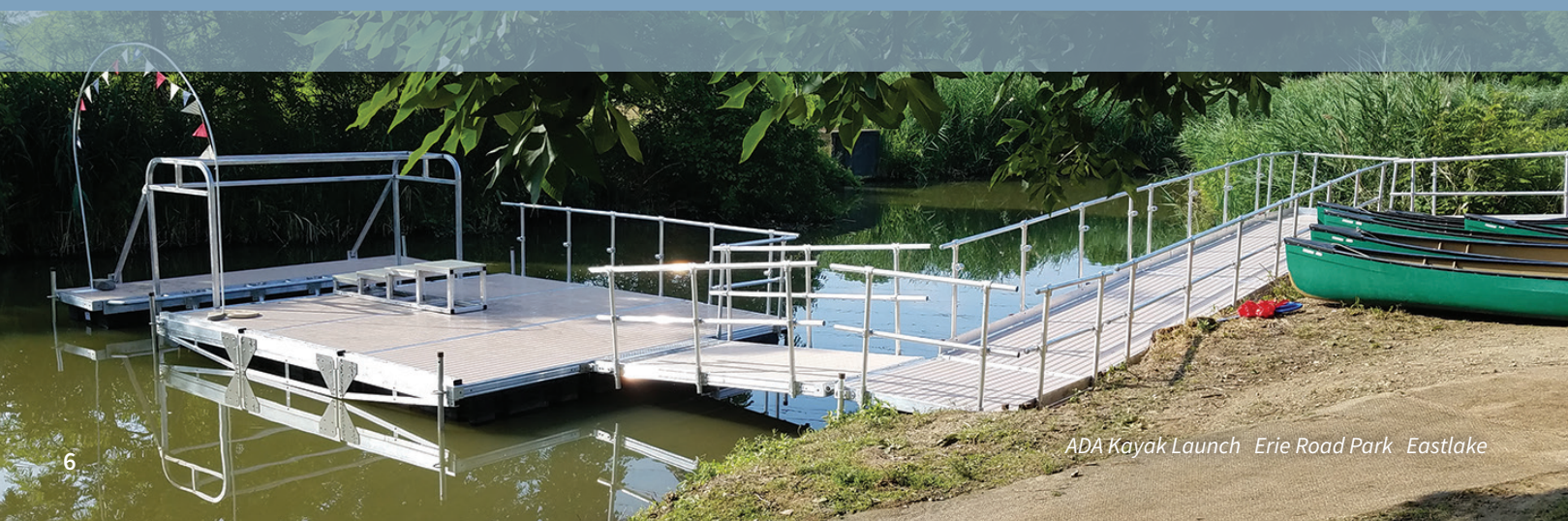
ADA Kayak Launch Erie Road Park Eastlake