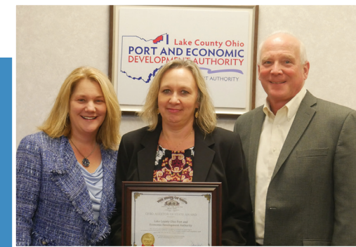
PORT STAFF RECEIVES HONORS FROM AUDITOR’S OFFICE